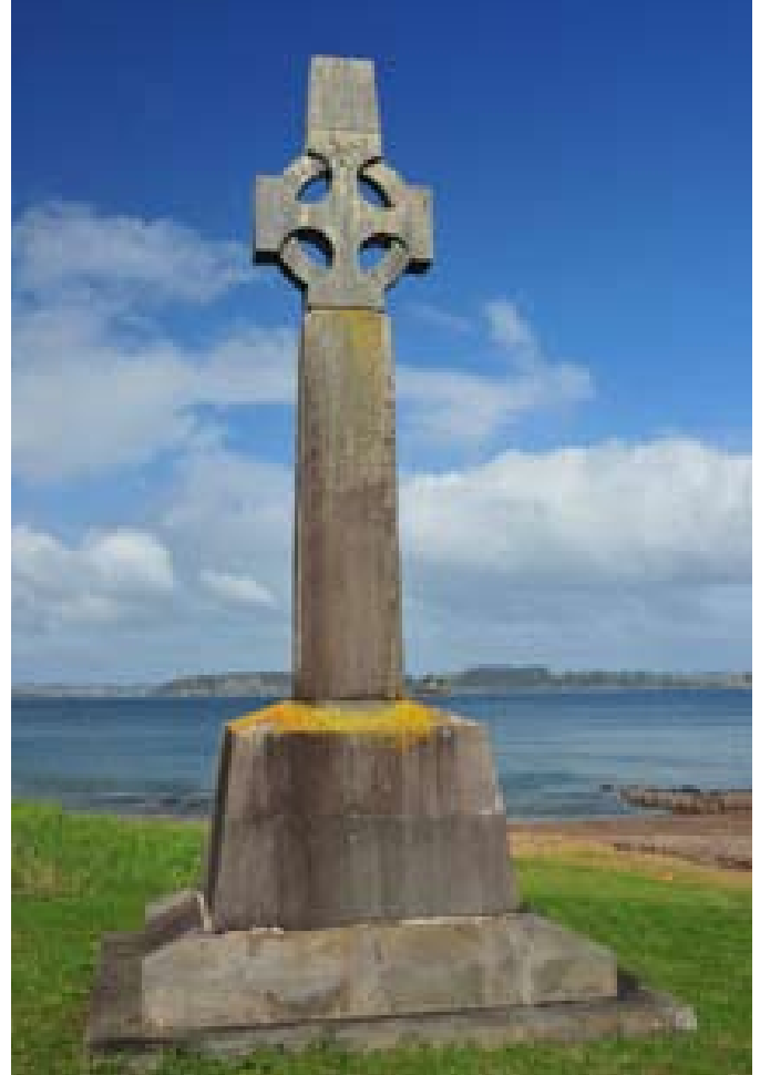
A Celtic cross at Rangihoua Bay commemorates the arrival of missionary Samuel Marsden and his Christian message in 1814.

Three years later another French navigator, Marion du Fresne, turned up and gave names to a few places, including 'Mascarin Peak', not knowing Cook had already named