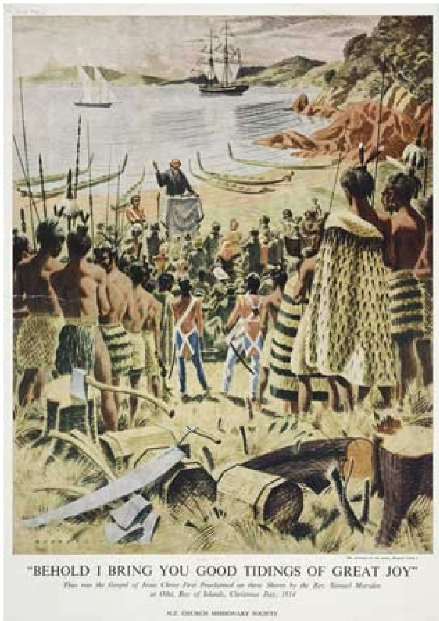
In December 1814, Anglican missionary Samuel Marsden arrived at the Bay of Islands after journeying from his base in New South Wales. He came ashore at Rangihoua Bay on Christmas Day and preached the first Christian sermon ever delivered in New Zealand, to Maori and Europeans. This is artist Russell Clark's depiction of the event, painted in 1964.

Permission of the Alexander Turnbull Library, Wellington NZ, must be obtained before any reuse of this image.