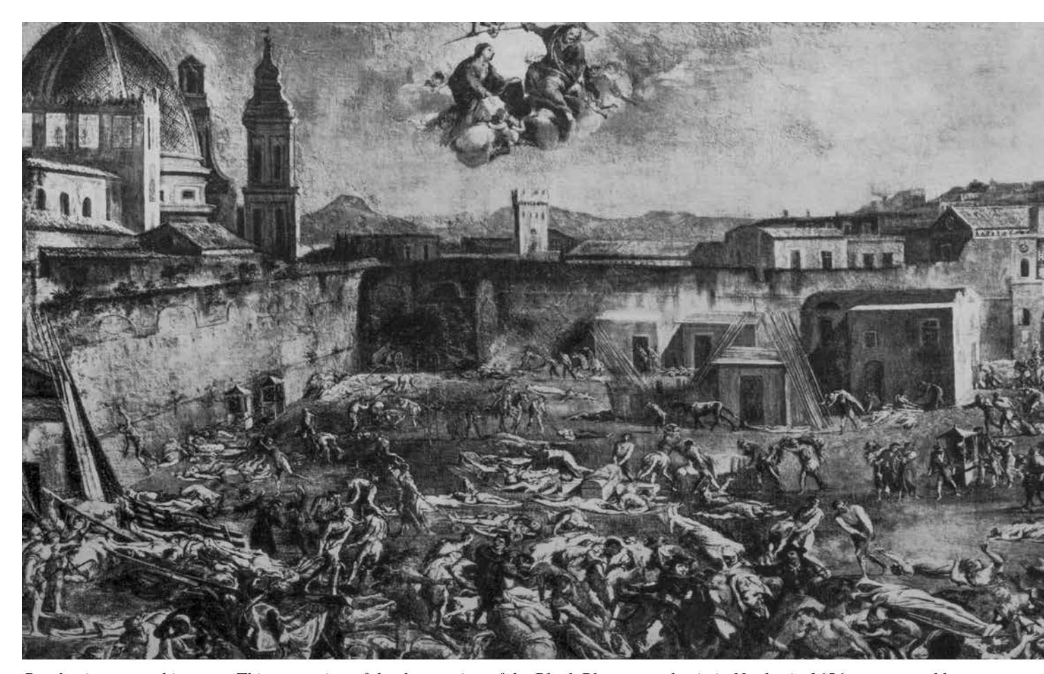
Pandemics are nothing new. This engraving of the devastation of the Black Plague pandemic in Naples in 1656 was created by Micco Spadaro, an eyewitness to its horrors.

But these dreadful diseases shrink into insignificance when compared with another noxious infection that has been storming across the globe for millennia. This vicious virus has been caught by everybody on earth today, and in fact has infected every single person who has ever lived! One hundred percent of all people