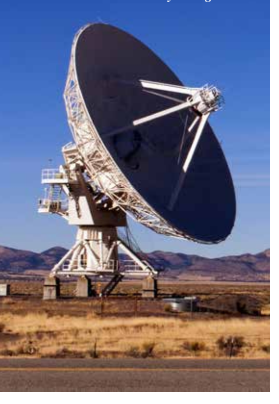
If the human race discovered other intelligent life, would the discovery change us?