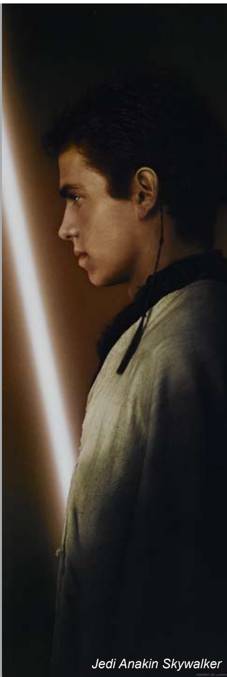
Jedi Anakin Skywalker

There was a fall in the number of New Zealand Jedi five years later, with some 20,000 people giving this as their religion in the 2006 census.