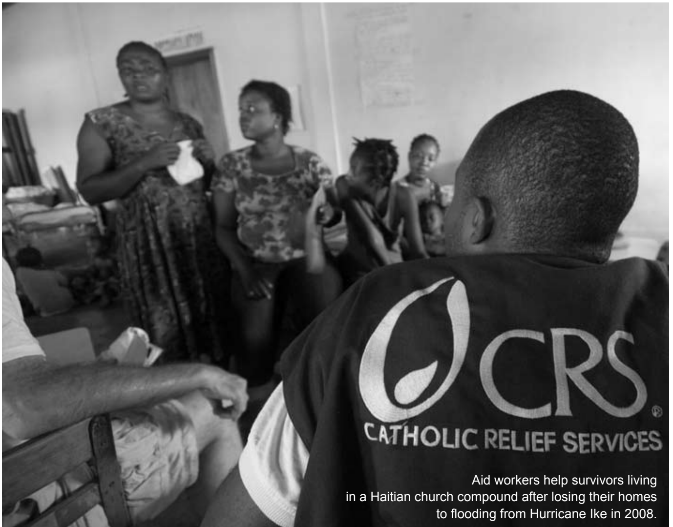
Aid workers help survivors living in a Haitian church compound after losing their homes to flooding from Hurricane Ike in 2008.

are not—to nullify the things that are, so that no one may boast before him'. 6