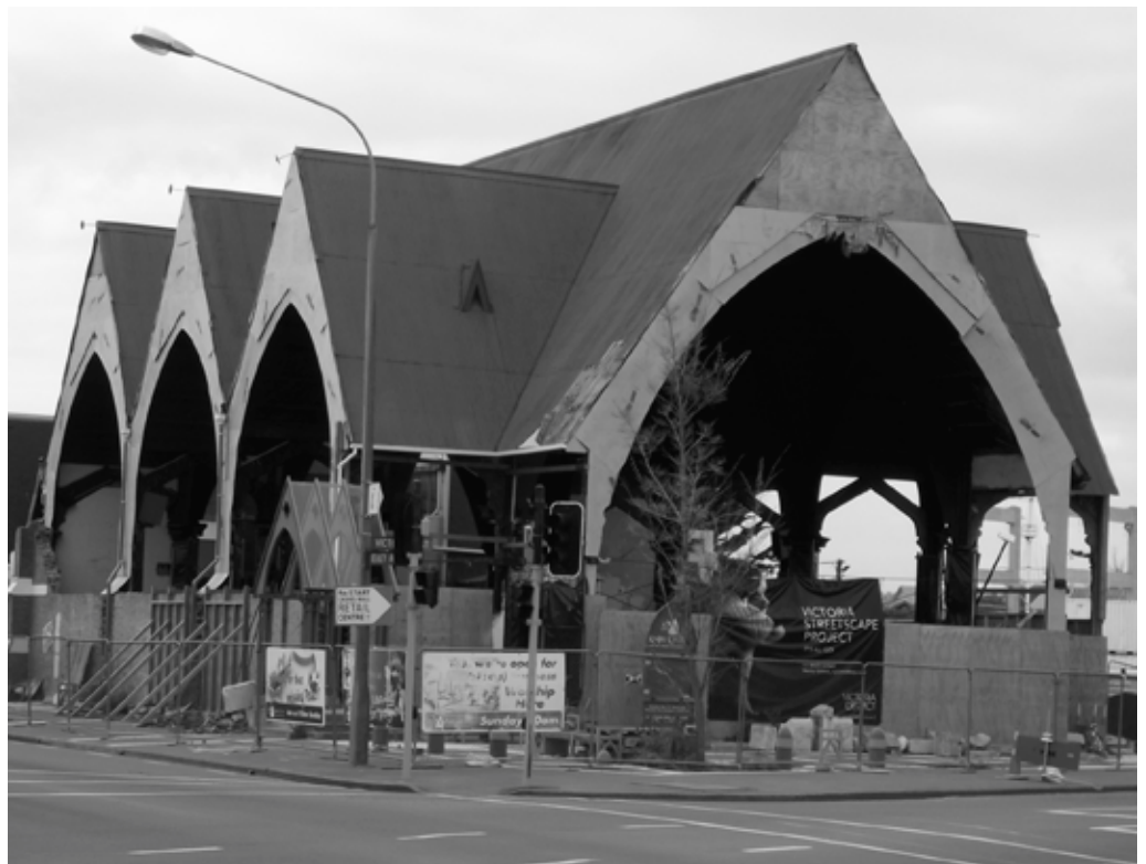
Is the earthquake-ravaged shell of Christchurch's Knox Presbyterian prophetic of the church's demise?

Figures from the last three censuses show the number of people identifying as Christian in NZ declined from 64.2 per cent in 1996 to 54.4 per cent in 2006. It is widely expected that the 2013 census figures when released will show for the first time that less than 50 per cent of the population of 'God's Own Country' identify as Christian!