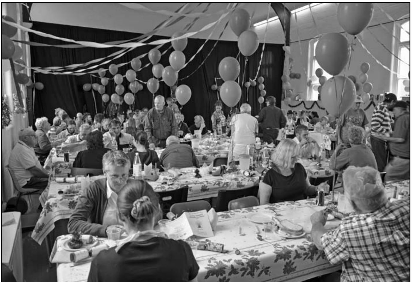
Thirty volunteers from the St Vincent de Paul Society and the Parish of Christ Church in Geelong, Australia, joined together in 2012 to put on a three-course Community Christmas Day dinner for more than 150 people in need.

William Barclay's Daily Study Bible comments: 'When we walk with Jesus, there comes a new vitality, a superabundance of life. It is only when we live with Christ that life becomes really worth living and we