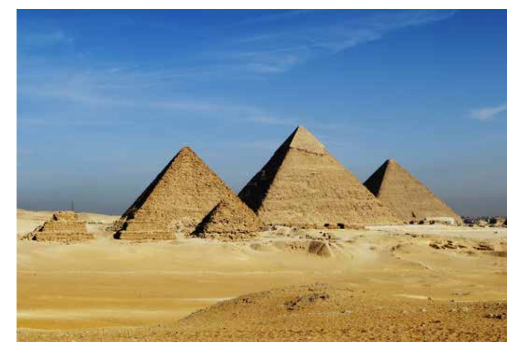
The pyramids of ancient Egypt are impressive testimonies to belief in the next life.

Islam teaches that Allah will judge everyone after their death and, according to their deeds on earth they will be sent to heaven or hell. The Muslim heaven is a garden