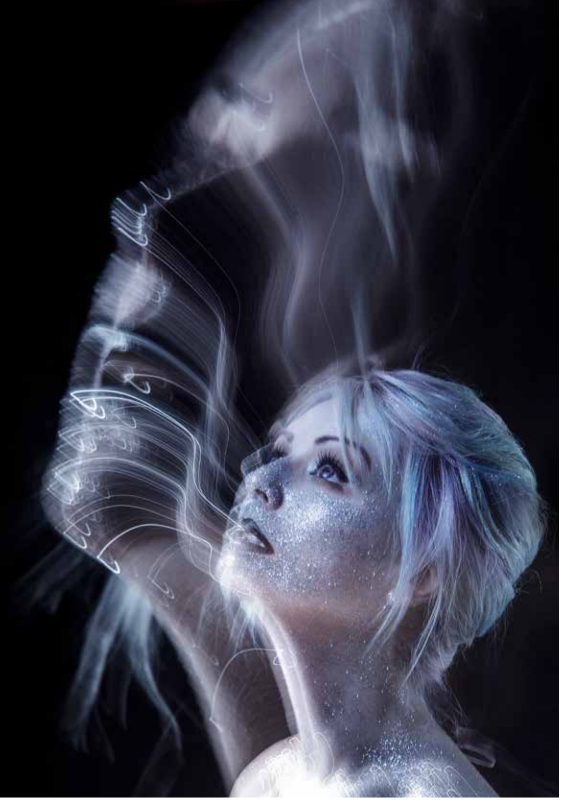
Down through history millions of people have believed in an afterlife, and this has been of great comfort to them. Is this just a fanciful illusion, or is there some basis for this belief?

with flowing streams, luscious fruits, richly covered couches, and beautiful maidens.