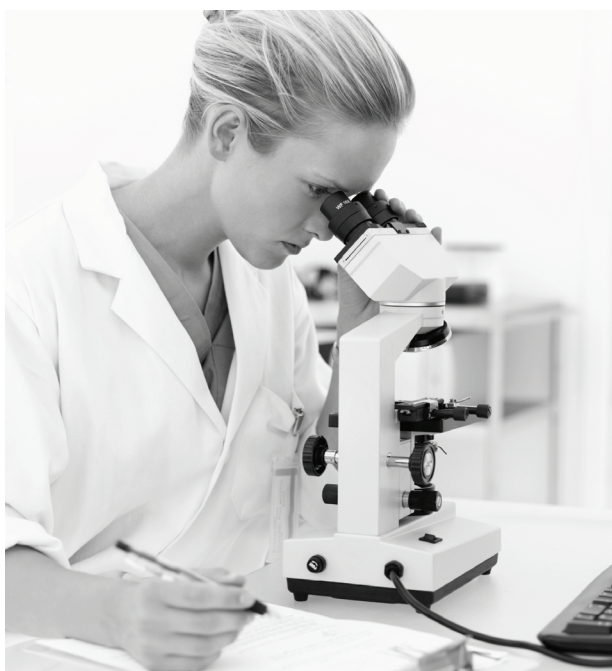
The existence of God can't be proven—or disproven—by conventional means of proof or scientific study.

Richard Dawkins, for example, has compared the idea of an imagined Flying Spaghetti Monster to belief in God. God is no more real or provable by conventional means of proof than a flying spaghetti monster, he argues. It is just made up.