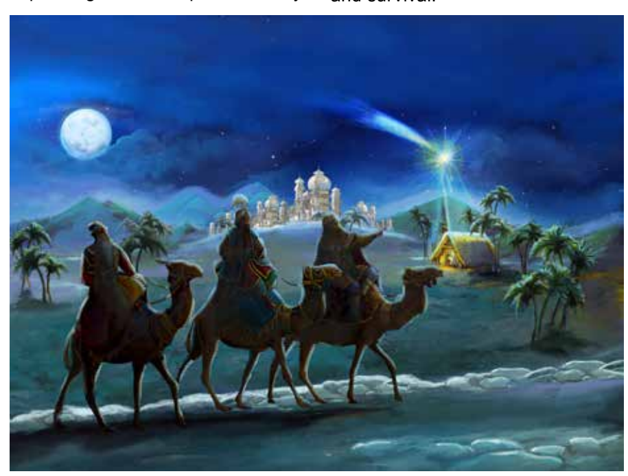
Although it is not known how many wise men traveled to Judea to find the infant Jesus, three are popularly shown in Christmas art: one black, one caucasian, and one oriental.

So, the Christmas story is important because it has endured and because it speaks of hope and survival.