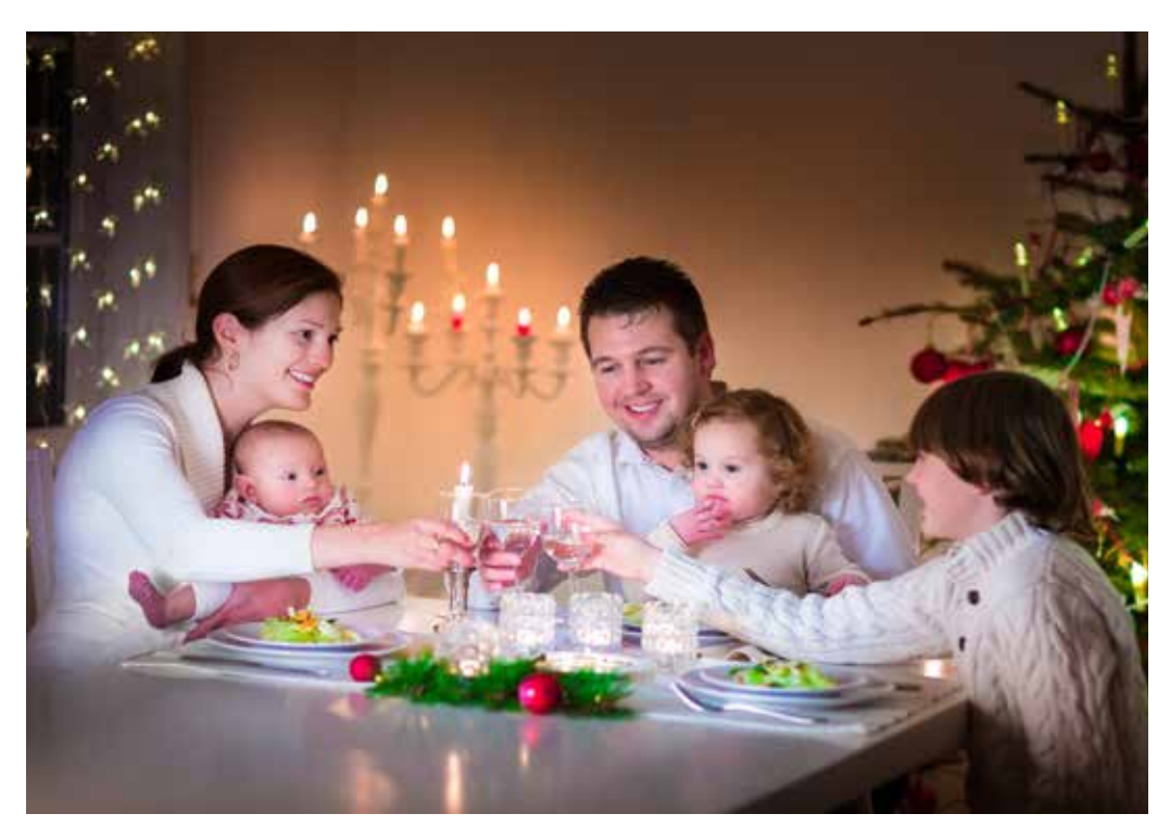
You can celebrate this Christmas knowing that you are a member of Jesus' family.