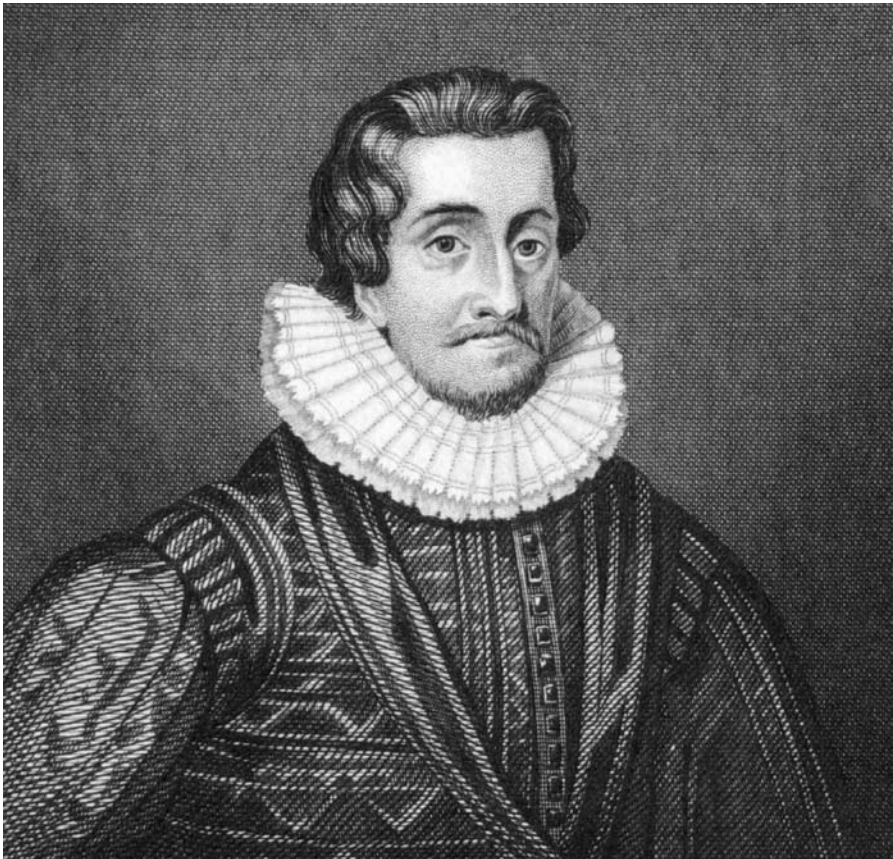
King James the First of England, from an engraving done in 1830, and published in London by Thomas Kelly.

The next effort to translate the Bible into English was made by a gifted scholar, fluent in eight languages, William Tyndale. His work was also vehemently opposed by the church of the time. He was forced to flee the country and do most of his translation in hiding in Germany. He completed the New Testament in 1525. Printing from movable type had recently been invented 2 so Tyndale had a