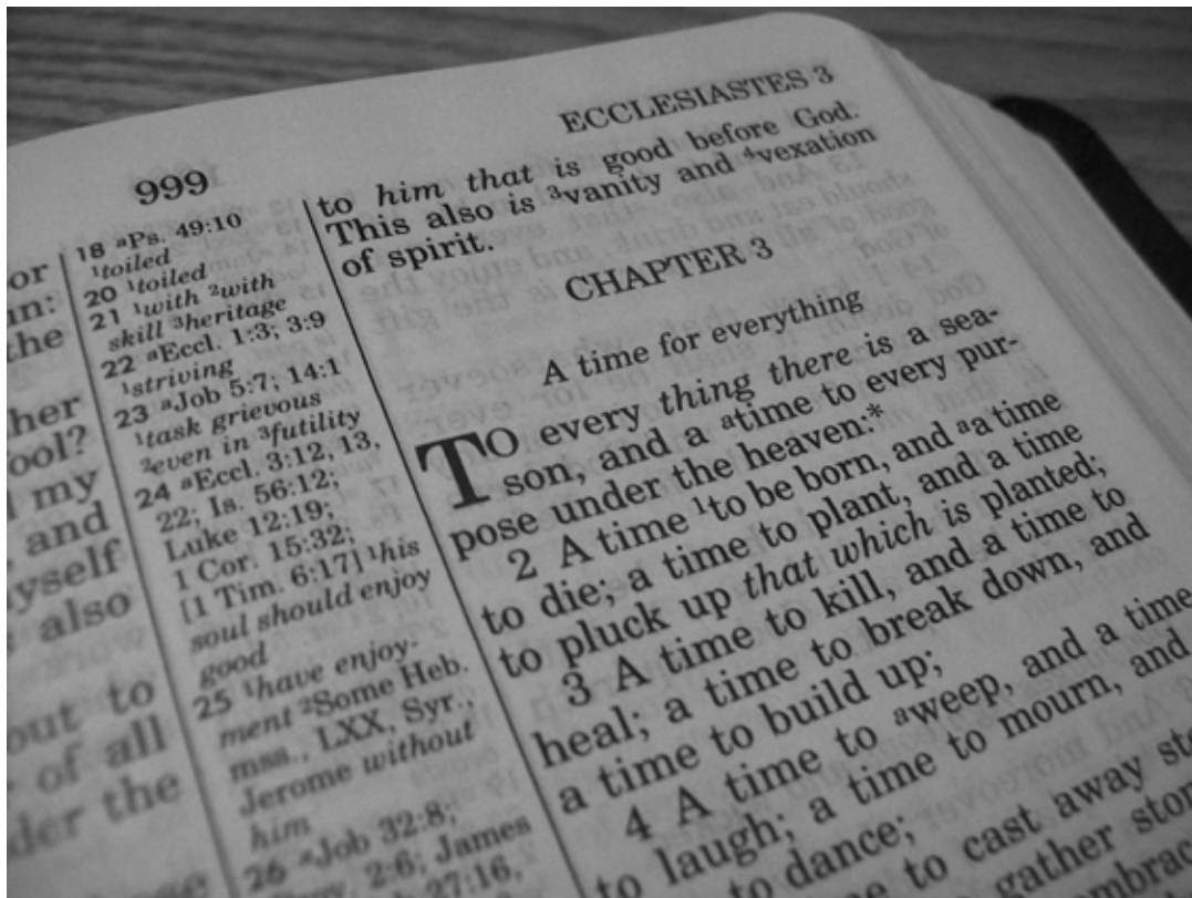
One of the most familiar passages in the language of the King James Bible: Ecclesiastes 3

has changed so much over 400 years that the language of 1611 is somewhat obscure to modern people. For a first-time reader, I would recommend the use of a more recent version, such as the New International Version 7 , or the New King James Version 8 . Other examples such as the Good News Bible 9 and The Message 10 version employ even easier-to-read, contemporary, colloquial idiom.