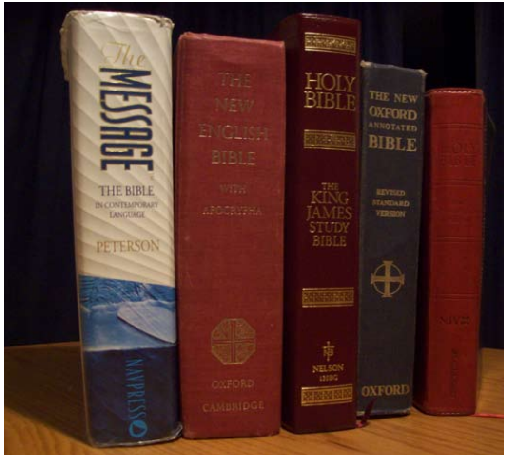
Modern translations of the Bible that owe their existence to the King James version (centre): The Message, The New English Bible, The Revised Standard Version, and The New International Version.

In 1603, on the death of Elizabeth I, James VI of Scotland ascended the throne of England as James I, and became the first monarch to unite Scotland, England, and Ireland as Great Britain. He was also the founding monarch of the American colonies, giving his name to Jamestown, Virginia. He was a talented scholar and wrote several books and articles on poetry, law, politics, and religion. He became patron for one of his most famous subjects, William