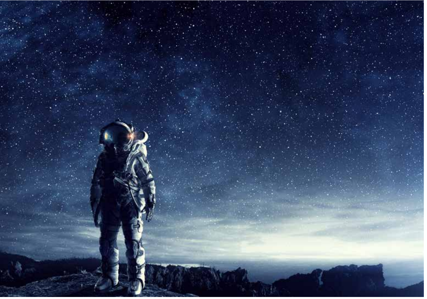
When I consider your heavens, the work of your fingers, the moon and the stars, which you have set in place, what is man that you are mindful of him, the son of man that you care for him?