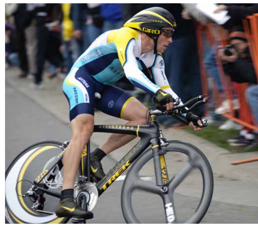
Disgraced cycling champion Lance Armstrong, seen here racing in February 2009, has lost his 'hero' status. As this article points out, high moral values are a vital attribute of a true hero.

On the other hand, someone like Austin Hemmings is an example of a true hero. In central Auckland in